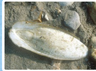
CUTTLEBONE Cuttlefish aren't fish at all, but are molluscs related to squid and octopus. This structure once gave the shape to the cuttlefish body.