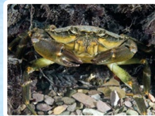
COMMON SHORE CRAB A common rock pool or shallow water species. Males have a triangular shape on their stomachs - females a semi-circular shape.