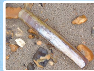
RAZORSHELL Shaped like an old-fashioned cut throat razor, these animals live buried end-up in the sand.