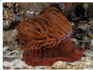
BEADLET ANEMONE Has a band of "beads" around the top of its body, hence the name. When the tide goes out they retract their tentacles so they won't dry out.