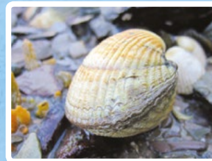
COCKLE Cockles spot predators using their many antennae and eyes. By extending their 'leg' outside the shell, they can jump around 10cm.