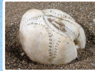
SEA POTATO A heart shaped sea urchin adapted for burrowing. It lives just below the surface on clean sand.