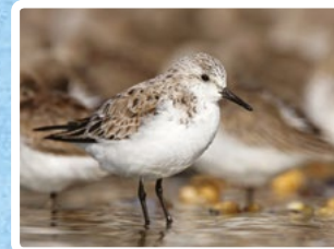
SANDERLING These birds can be spotted running up and down the shore as each wave comes in. A winter visitor to the UK.