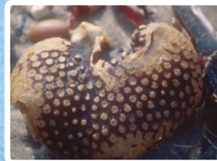
KELP HOLDFAST Curious oddments that can look like skeleton sections, but each is simply the holdfast, or 'roots' of large seaweeds known as kelp.