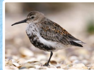
DUNLIN The dunlin is the most widespread and common wader in Europe. It has a slightly down-curved bill and a black belly patch in breeding plumage.