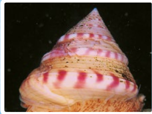
PAINTED TOP SHELL A tall shell with stripes of purple and white in a striking conical shape. The body of this "snail" is also colourfully flecked with purple, red and brown.

Explore the seashore with the Marine Conservation Society