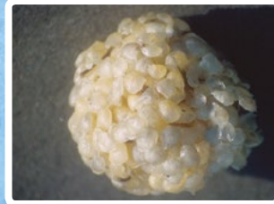
COMMON WHELK EGG CASES Puffy balls of white eggcases laid by the common whelk. Used to be used by sailors as wash balls!