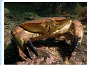
EDIBLE CRAB This pinkish brown crab has chunky claws and its shell looks like a pastry crust.