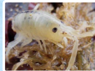
SANDHOPPER This shrimplike creature lives amongst seaweeds on the beach, they are found hopping around when the tide is out.