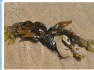
BLADDERWRACK The small air-filled bladders along the fronds help this seaweed to float towards the surface of the water to photosynthesise.