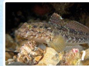
ROCK GOBY Gobies are often confused with blennies but they have two distinctly separate fins on their backs whereas blennies only have one back (dorsal) fin.