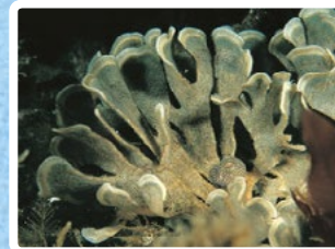
HORNWRACK Remains of a colony of hundreds of tiny animals called bryozoans, or 'moss animals'. It has a distinctive lemon-like smell when fresh.