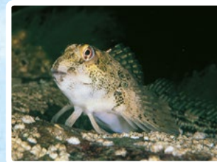
COMMON BLENNY These fish can change colour to blend in with their surroundings. They have sharp teeth for crunching barnacles off rocks.