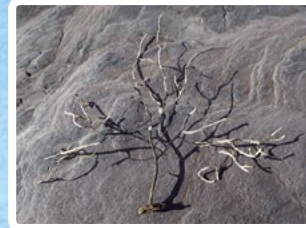
PINK SEA FAN SKELETON Although they look like plants, pink sea fans are actually colonies of coral that are made up of animals whose hard skeletons run through the fan.