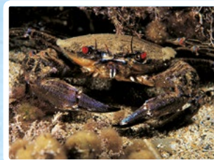
VELVET SWIMMING CRAB Its upper shell has a feeling of soft velvet and its blood red eyes and aggressive demeanor have given it the common name "Devil Crab".