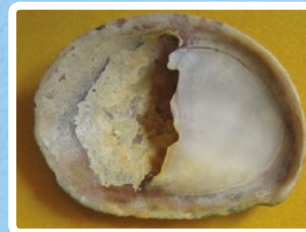
SLIPPER LIMPET Accidentally introduced to England from North America and now found in huge numbers. It has no predators in Europe.