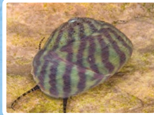
PURPLE /FLAT TOP SHELL This shell is a flattish cone shape with stripes of reddish purple.