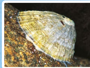
COMMON LIMPET A snail with a homing instinct! It grazes on algae while the tide is in and returns to the same spot, called a home scar, when the tide retreats.