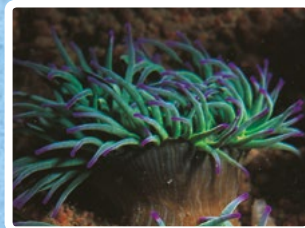
SNAKELOCKS ANEMONE These anemones can have up to 200 tentacles! Their tentacles remain out all of the time, they don't retract them like other anemones.