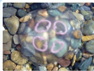
MOON JELLYFISH Mostly harmless, though may sting sensitive skin. Jellyfish are the favourite food of the leatherback turtle.