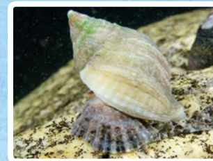
DOG WHELK Meat-eating sea snails that drill holes into limpets, turn their insides into soup and suck up the yummy contents!