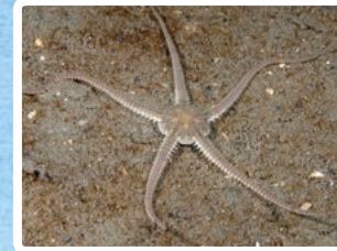
BRITTLESTAR These guys have a small central disk and long slender arms which they can self-amputate if being attacked and then regrow once the wound heals.