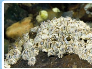
BARNACLES These animals live upside down, permanently stuck to the rock with their legs sticking upwards ready to catch drifting food.