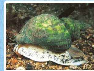
COMMON WHELK A large edible sea snail, twice the size of the dog whelk, the empty shell makes a good home for hermit crabs so please leave these shells on the shore.