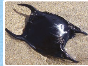
MERMAID'S PURSE Egg cases of dogfish, skates and rays, which attach to seaweed with entwining tendrils and often wash up once the animals have hatched.