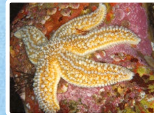
COMMON STARFISH The familiar five arms and usual orange colour are unmistakable. They move with their tube feet and eat with their stomachs inside out!