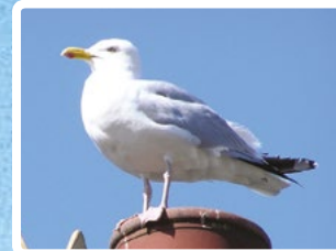
HERRING GULL These cheeky fellows with the red spot on their beaks are found along most coasts and are easily attracted by a bag of chips!